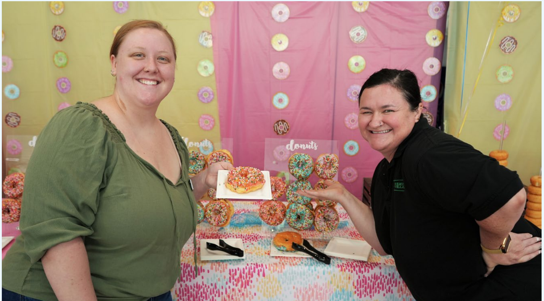
DONUT DAY CELEBRATIONS SEE PG. 7